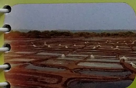
BATIM SALT PAN