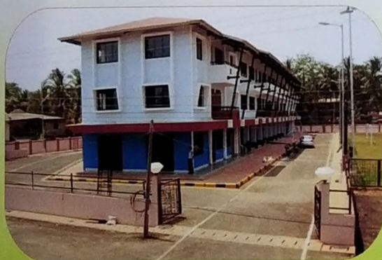
BATIM PANCHAYAT BUILDING